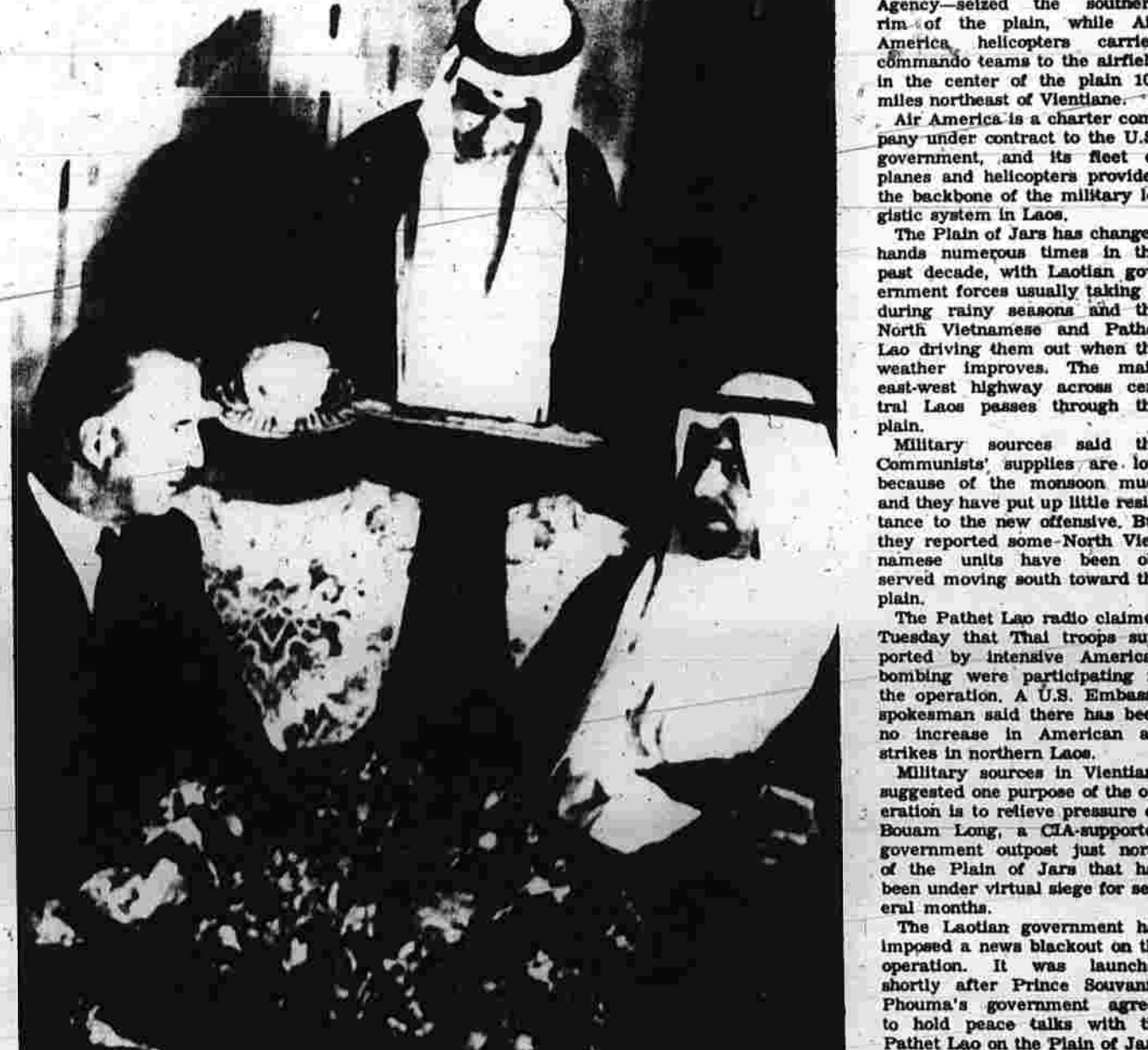
Greetings from the Sheik Vice President Spiro Agnew sits with Kuwaiti Crown Prince and Premier Sheik Jaber Ahmed Al-Sabah last night in an unidentified center in Kuwait. Agnew is on tour of Middle East.