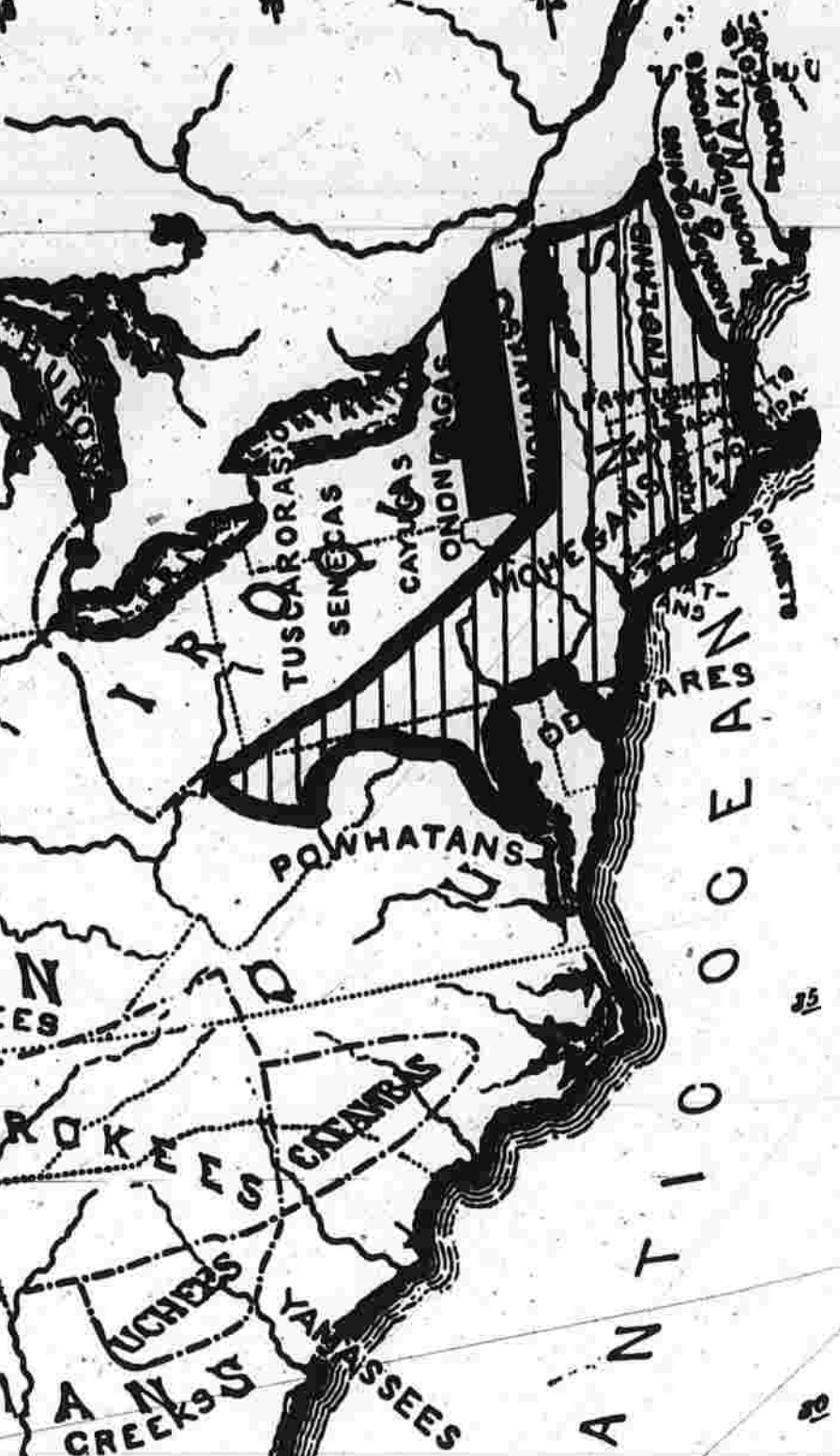
Area shaded by vertical lines is territory claimed by the tribe. Solid black area is land on which the Mohegans claim they were granted hunting rights.

U.S. reconnaissance planes have been watching developments in the area of the disputed islands off the coast of Vietnam.